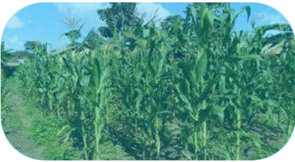
local Agriculture Farm