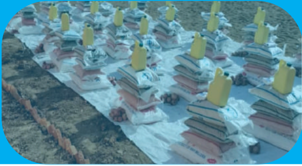
Delivering of Humantriatian aids