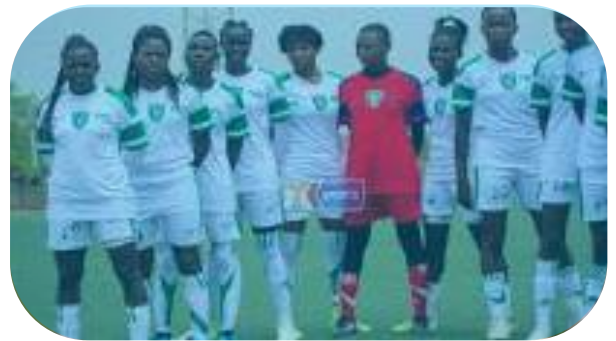
Girls Empowerment in Sport