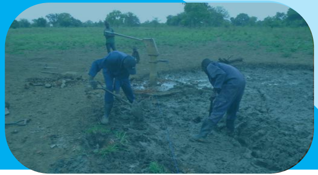
Rehabilitation of Borhole