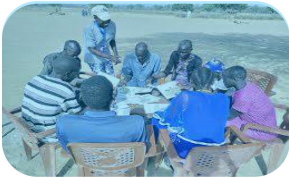
Community Peace Building