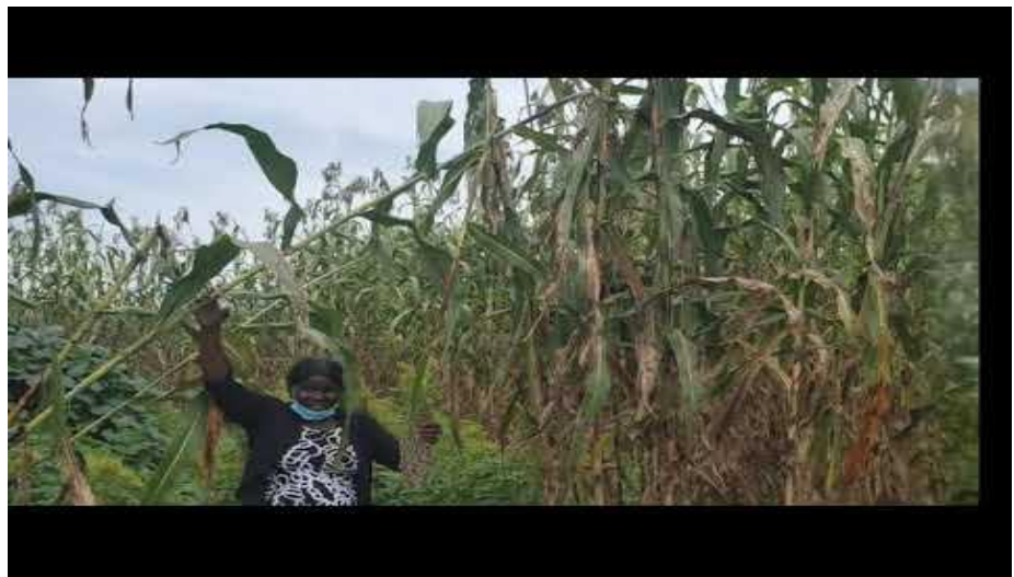
Delegation Touring the Farm at Jebel Ladu Payam, South Sudan

Delegation from BC Global USA Visiting the BC Global Farm in South Sudan. Mounting Challenges are facing the farmers and are not limited to a Lack of Clean Water and Tractors to support the communities but also to the Extension Agriculture